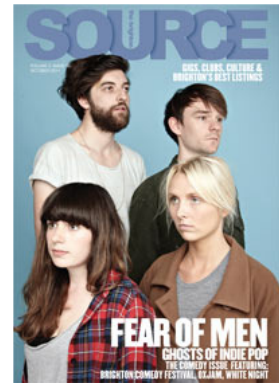
Click Cover To Read PDF Mag Online